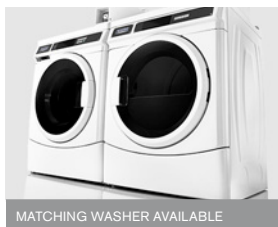
MATCHING WASHER AVAILABLE

*See maytagcommerciallaundry.com for complete warranty details.