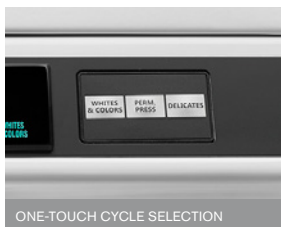
ONE-TOUCH CYCLE SELECTION