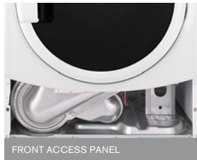
FRONT ACCESS PANEL